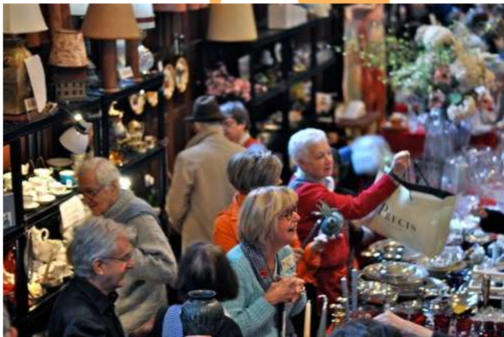
Business is brisk at the Trifles and Treasures.

October 4 is the first Communion Service of the new season, World Communion Sunday.